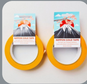
Nippon gold tape