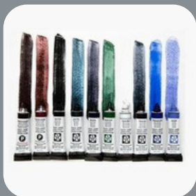
Daniel Smith Watercolor